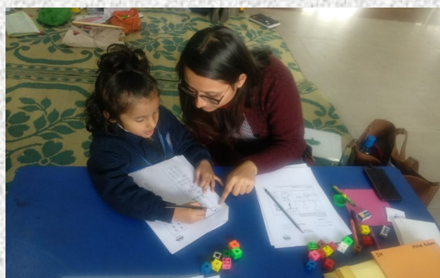
Endline Assessment being conducted - SKV, Pandara Road, Delhi

To consolidate the effectiveness of the intervention of the Pathshala programme an end line assessment was conducted. Ahvaan team went through a training to conduct the assessment. The assessment started on 17 th February 2020. Students of Kindergarten, Grade I and II participated in the assessment. This academic year, to improve the validity and reliability of the end line assessment the percentage of students