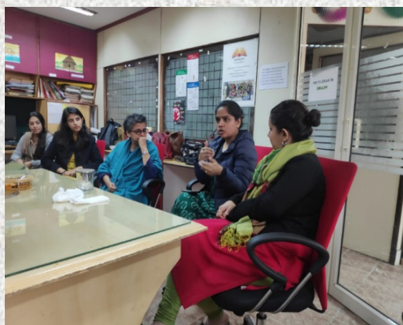
Tata Trusts Representatives in Neev Schools and Meeting the Ahvaan Team, Delhi