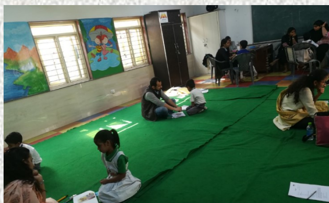
Endline Assessment being conducted - SBV, Rouse Avenue, Delhi

In the beginning of the academic session in April 2019, a diagnostic tool was used as base line for student assessments in KG, Class 1 and Class 2 mainly in English and Mathematics. 436 student assessments were conducted in the Pathshala schools. This base was conducted to understand the learning needs of the children. Based on the results of base line assessment, Pathshala Programme was implemented in SBV Rouse Avenue and SKV Pandara Road. The data and findings