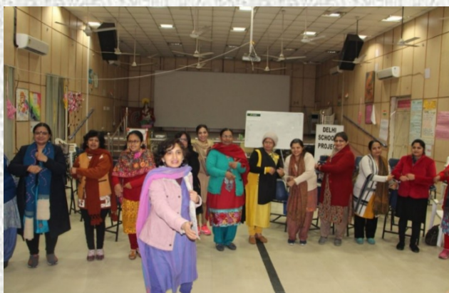
Training of Pre-Primary Educators, RK Puram DIET, Delhi