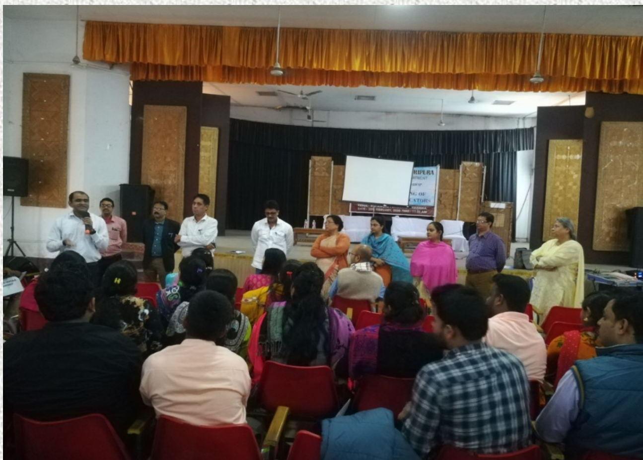
Orientation with Principals of Schools, Agartala, Tripura

Ahvaan was invited to work in the state of Tripura and create systems and processes to build a strong foundation of pre-primary education across the state. The first phase of 'Capacity Building of Pre-Primary Educators, Tripura' was initiated in this quarter and officially on the 9 th January 2020. The project highlights for this quarter are: