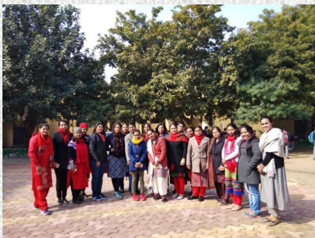
Training of Pre-Primary Educators, GGSSS, No.2, Najafgarh, Delhi

Ahvaan was invited by the SCERT, Delhi to conduct Capacity Building workshops for pre-primary teachers of schools under the different urban local bodies of Delhi – Municipal Councils, Corporations and Cantonment Boards. In this quarter, training for 70 pre-primary teachers was successfully conducted, between 8 th to 10 th January 2020. The workshop that was held at R.K Puram DIET for a batch of 40+ teachers, imparted extensive training on: