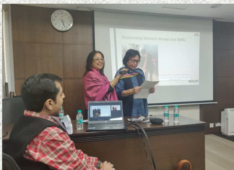
Ahvaan Team Sharing their Experiences as Coaches in the Delhi Government Schools, SMBC office, New Delhi.