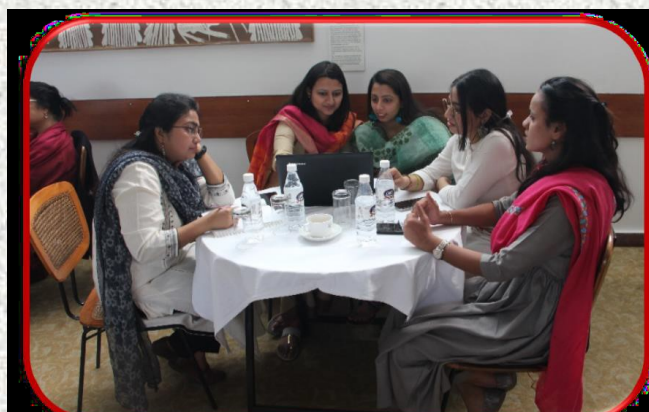
Ahvaan Trust – Annual Review Meeting – Glimpses of the Proceedings

Each of the presentations detailed the following issues of planning, execution and improvement: